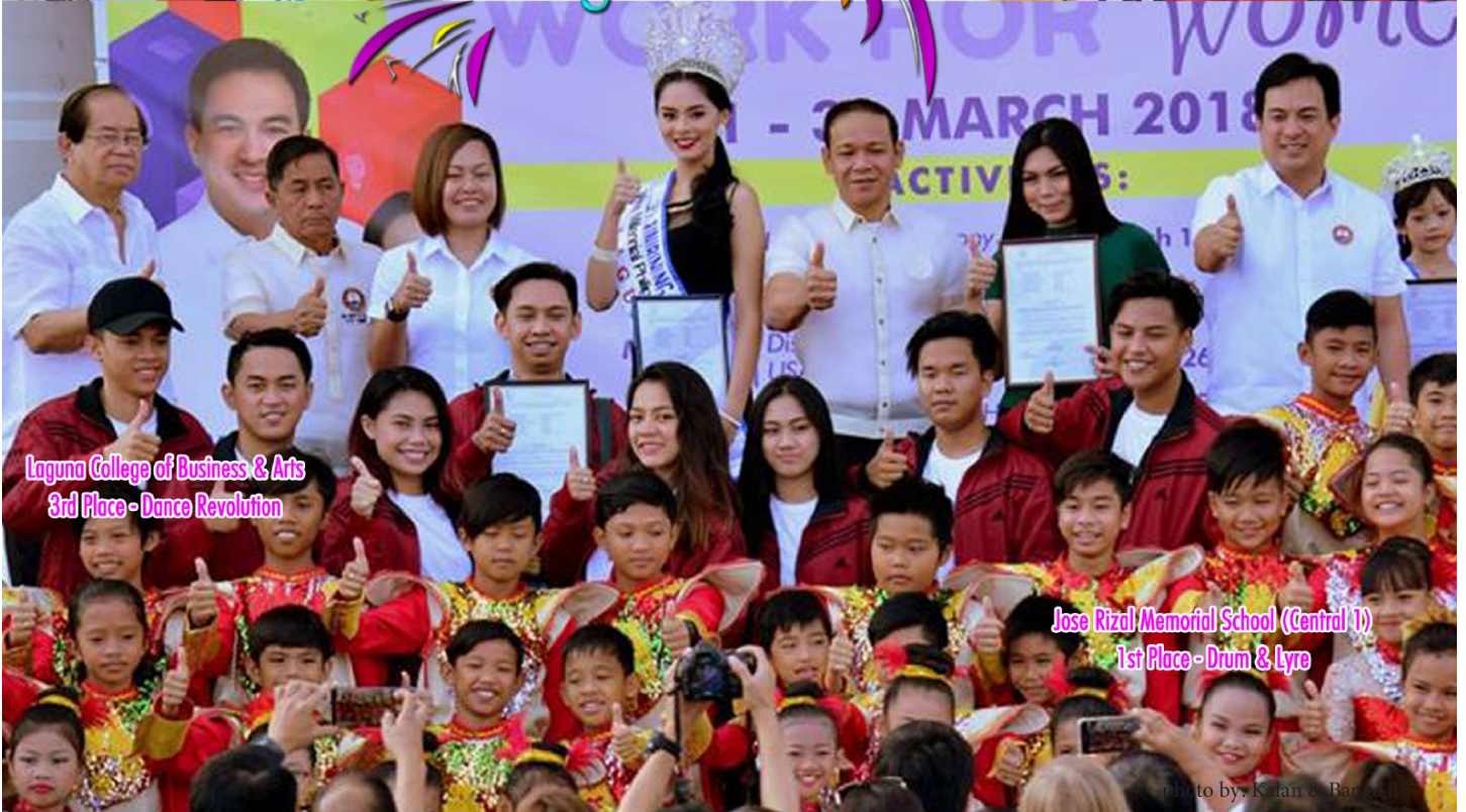
Laguna College of Business & Arts 3rd Place - Dance Revolution