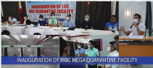
INAUGURATION OF RGC MEGA QUARANTINE FACILITY

EFFICIENTLY ISOLATE COMMUNITIES AND INDIVIDUALS & PROVIDE QUALITY CARE FOR COVID-19 PATIENTS