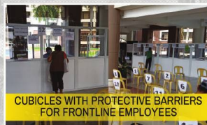
CUBICLES WITH PROTECTIVE BARRIERS FOR FRONTLINE EMPLOYEES

Fully operational government offices with skeletal workforce & adaptive infrastructures to strictly comply with the IATF guidelines & health protocols