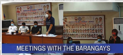
MEETINGS WITH THE BARANGAYS

Coordinated operations with the National Government and different sectors of the community to aggressively address the pandemic