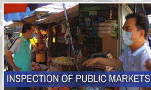
INSPECTION OF PUBLIC MARKETS

Fully operational government offices with skeletal workforce & adaptive infrastructures to strictly comply with the IATF guidelines & health protocols