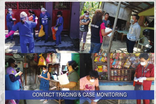
CONTACT TRACING & CASE MONITORING