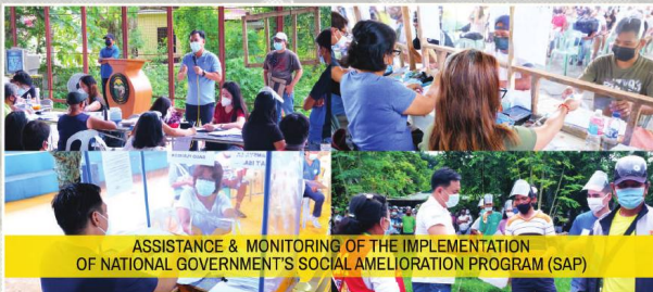
ASSISTANCE & MONITORING OF THE IMPLEMENTATION OF NATIONAL GOVERNMENT'S SOCIAL AMELIORATION PROGRAM (SAP)

Addressing consequences of prolonged quarantine (through assistance programs for vulnerable sectors)