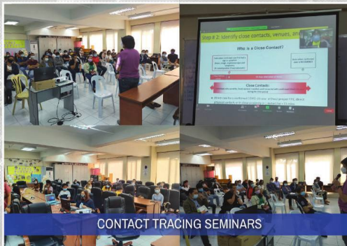
CONTACT TRACING SEMINARS