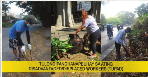
TULONG PANGHANAPBUHAY SA ATING DISADVANTAGED/DISPLACED WORKERS (TUPAD)