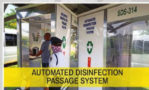
AUTOMATED DISINFECTION PASSAGE SYSTEM

Coordinated operations with the National Government and different sectors of the community to aggressively address the pandemic