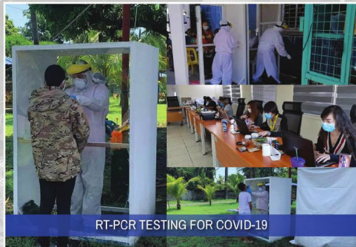
RT-PCR TESTING FOR COVID-19