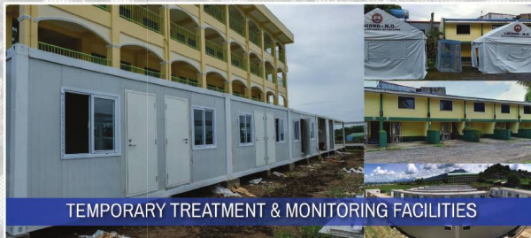
TEMPORARY TREATMENT & MONITORING FACILITIES

Establishment of Mega Quarantine Facility (Regional Government Center) & other Temporary Treatment and Monitoring Facilities