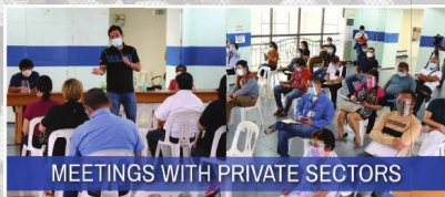
MEETINGS WITH PRIVATE SECTORS