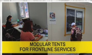
MODULAR TENTS FOR FRONTLINE SERVICES