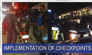
IMPLEMENTATION OF CHECKPOINTS