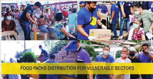
FOOD PACKS DISTRIBUTION FOR VULNERABLE SECTORS