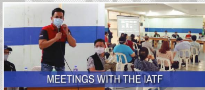
MEETINGS WITH THE IATF

ENGAGE AND MOBILIZE THE GENERAL PUBLIC TO LIMIT EXPOSURE AND TRANSMISSION OF COVID-19