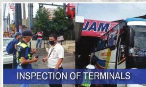
INSPECTION OF TERMINALS