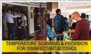
TEMPERATURE SCANNING & PROVISION FOR DISINFECTANT/ALCOHOL