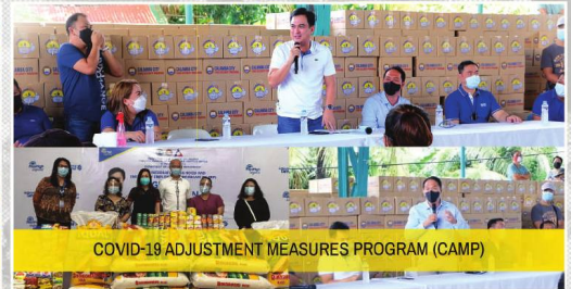
COVID-19 ADJUSTMENT MEASURES PROGRAM (CAMP)