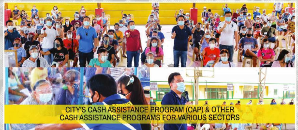
CITY'S CASH ASSISTANCE PROGRAM (CAP) & OTHER CASH ASSISTANCE PROGRAMS FOR VARIOUS SECTORS